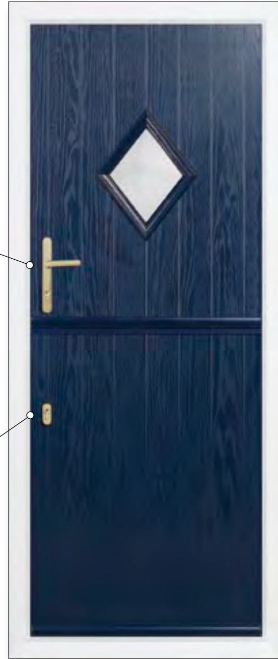
The Stable Door in Blue with Obscure Glass

The stable door features high security locks that engage into the outer frame and an interlock between the top and bottom leaf.