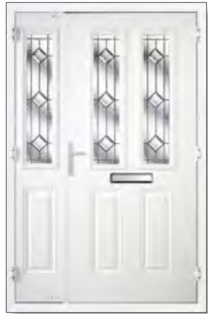
Inside View of our Door and a Half