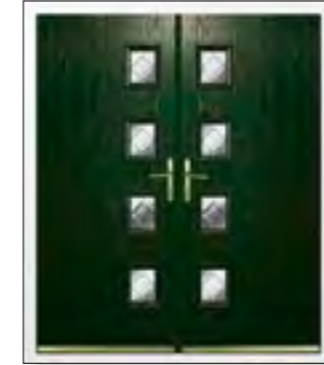
Hampshire Double Door with Bevelled Glass**