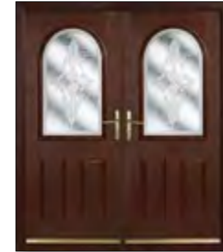
Norfolk Double Door with Brilliance Glass †

Some of the Twin Door Design Options Available: