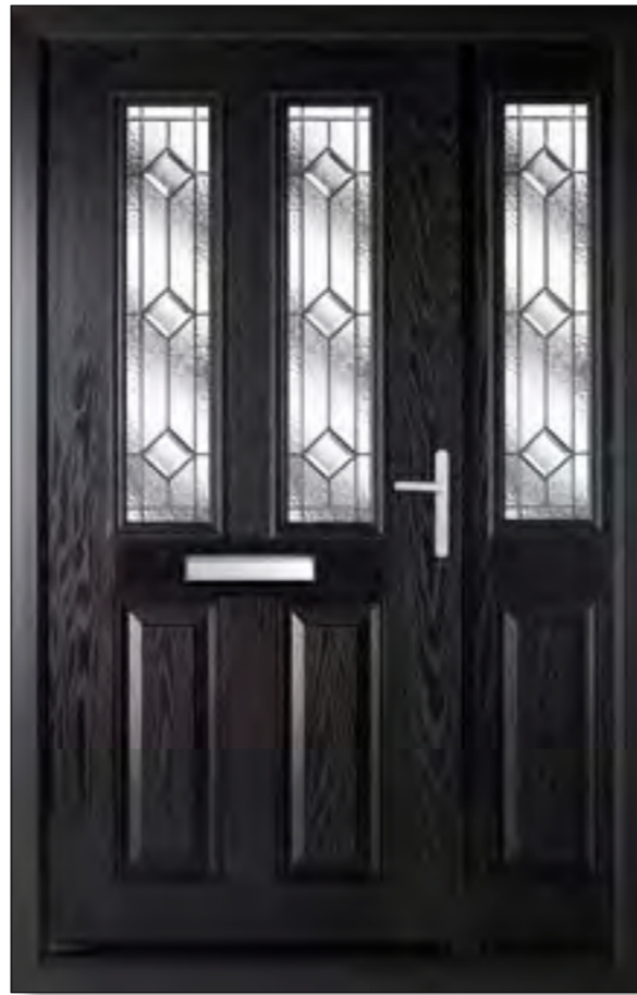
Essex Door and a Half with Simplicity Glass ‡

Complement your entrance door with matching side panels. Perfect for wider apertures, there are a number of possible combinations from our Suffolk and Essex ranges. Where space allows, side panels enhance darker interiors by increasing light levels and present a smart and co-ordinated appearance to the outside world.