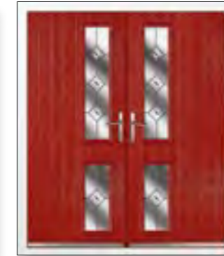
Dorset Double Door with Fusion Glass*