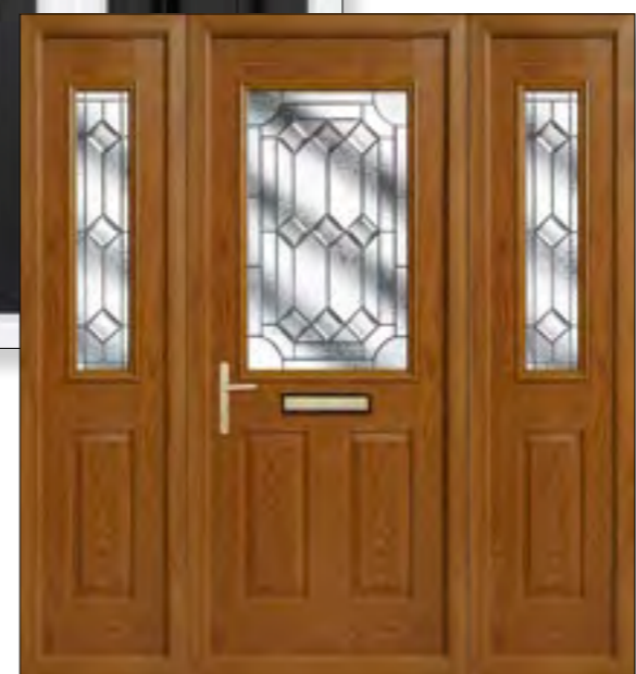
Suffolk Twin Panel with Simplicity Glass ‡