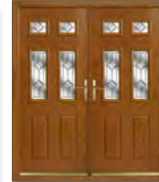
Kent 4 Double Door with Simplicity Glass ‡