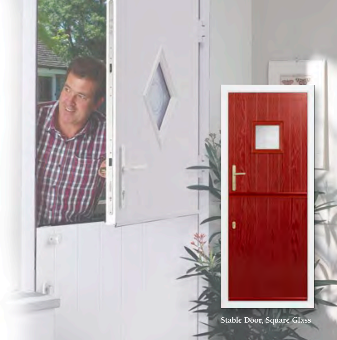
Stable Door, Square Glass