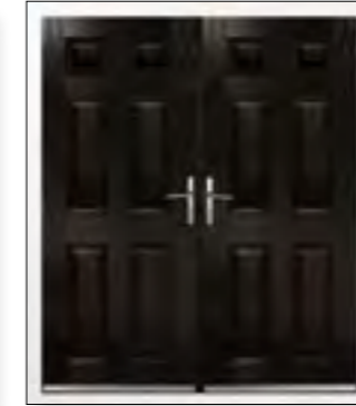
Kent Solid Double Door