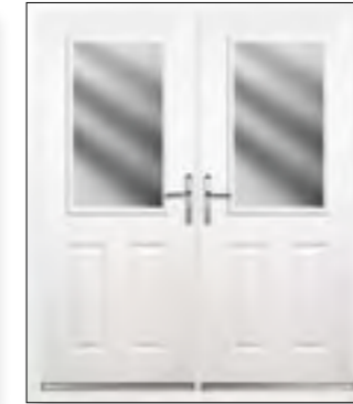
Suffolk Double Door with Obscure Glass