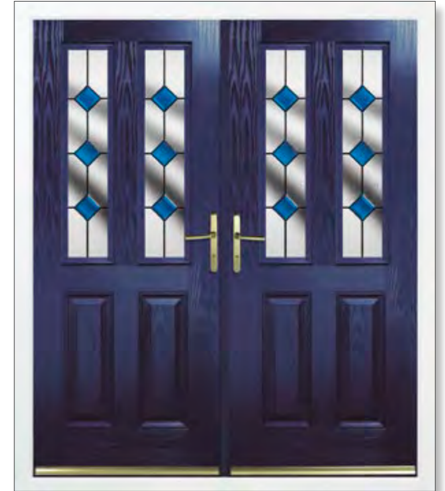
Essex Double Door with Blue Bevel Glass**